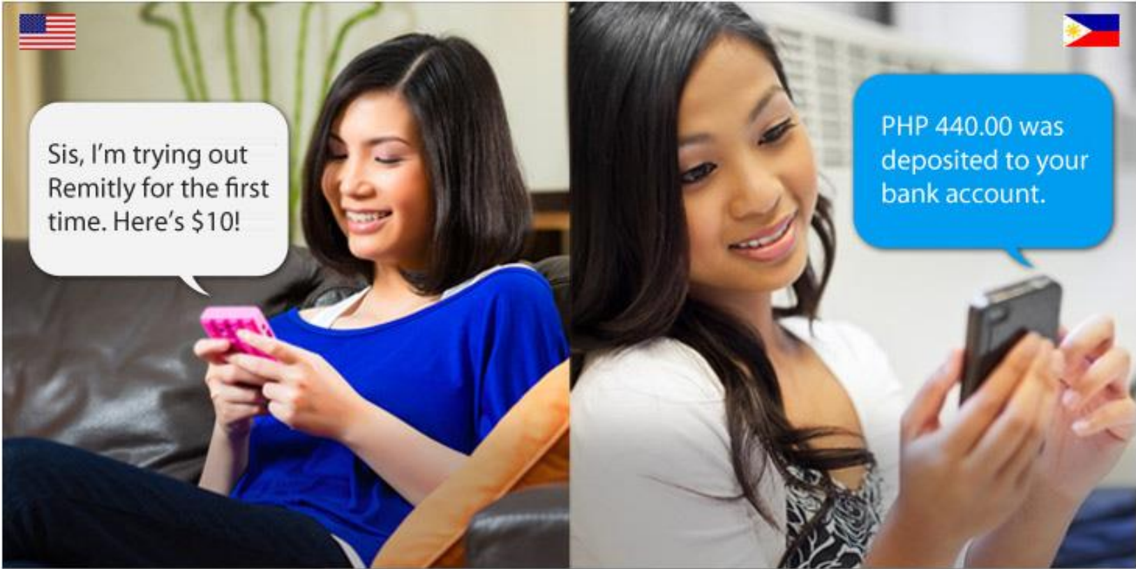
A mobile platform to send money globally