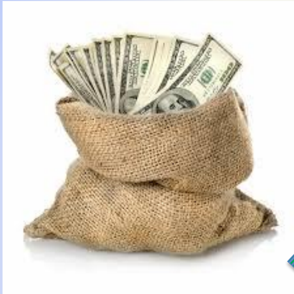
Prepaid Minutes $650B