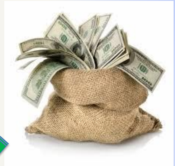
International Remittance $500B